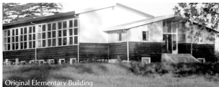
Original Elementary Building

You are invited to join the PCS journey and consider how your visionary actions can impact and equip future generations.