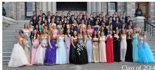
Class of 2014

More information about CSS and PCS is available at www.PacificChristian.ca/planned-giving